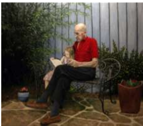
Grandpa by Jeff Thelen

The meeting is open to interested guests. A packet of literature and free samples of paint and gels will be available for all those who attend. For more information contact http://www.goldenpaints.com/ .