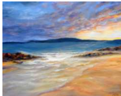
Sherri Hale—Beach Sunset Second Place Peoples Choice Dunwoody Library Gallery

Garrett will explain transferring digital and ink jet images onto a variety of flat surfaces, i.e. non-porous papers, acetate, acrylic skins, even aluminum foil using Golden OPEN Acrylics to achieve a variety of effects using gels and additives.